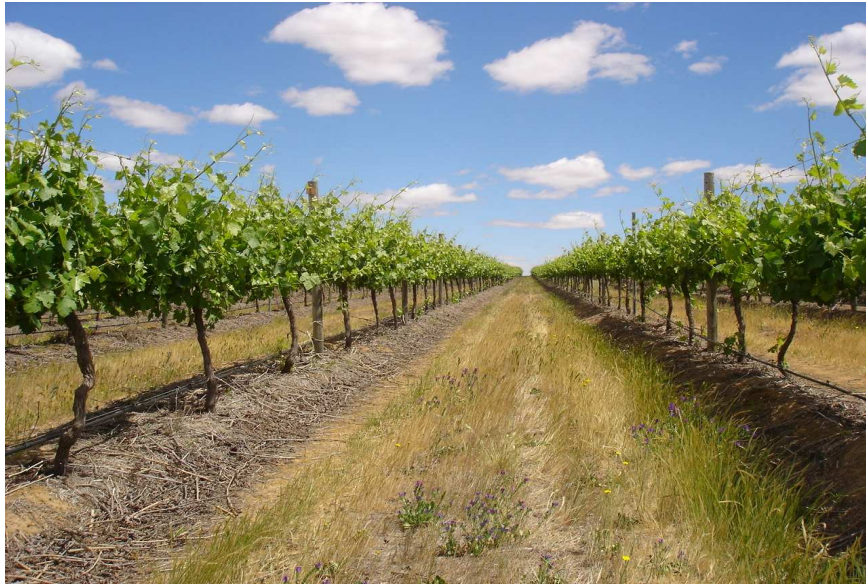
Photo above of the Shiraz vines late October 06

At the time of writing this newsletter, spring is well under way in the vineyards with very even growth throughout. Even though our family cattle property is struggling with the very bad drought, proximity to the Murrumbidgee River means we can supply sufficient water via drip irrigation to the vines for them to grow in an optimal manner.