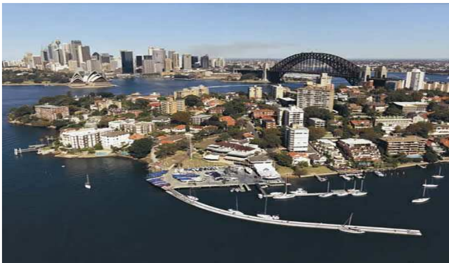
Photo above of the Squadron at Kirribilli.

For those that missed it, our annual Sydney wine tasting was held at the Royal Sydney Yacht Squadron in Kirribilli in September and it was a very good night. The Squadron is one of the most beautiful clubs in Sydney and an excellent venue for wine tastings. Due to this years success we will definitely have another big tasting at the Squadron next September. For anyone who did not get an invitation but would like to be on the list for next year, please let us know.